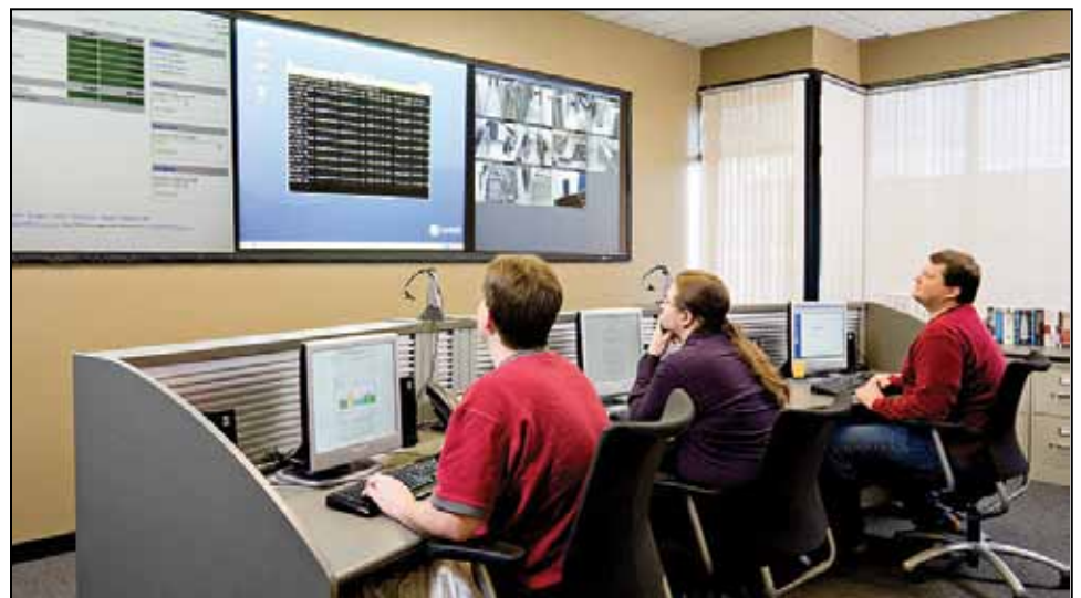
The EasyStreet Network Operations Center (NOC) monitors leaf nodes on the Oregon Health Network around-the-clock.

In fact, the data the NOC monitors is actually simulation data that speedily travels up and down every link of the data highway and reports back on road conditions. “We simulate high-sensitivity traffic and look at its quality,” Luke explains. “If the quality drops below what’s required for that type of traffic, we contact the people responsible.”